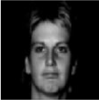
Figure 3.11: The given facial image.

database is shown in Figure 3.12. Although the two images differ slightly, they are clearly of the same individual.