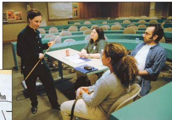
SUMS up. This undergraduate math symposium at Brown University is one of the innovations fostered by the VIGRE program.